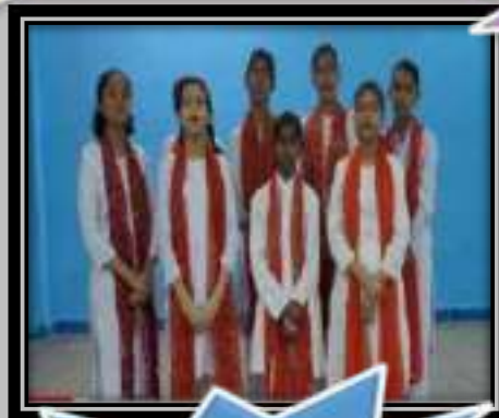
Group Singing Krishnanjali (BBPS-INDERPRASTHA YOJNA)