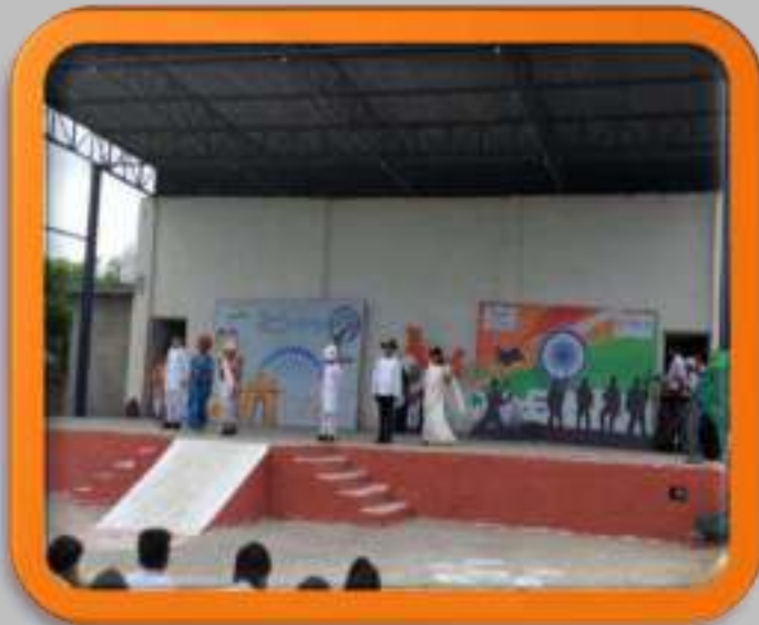
ARYABHATTA HOUSE- ASSEMBLY