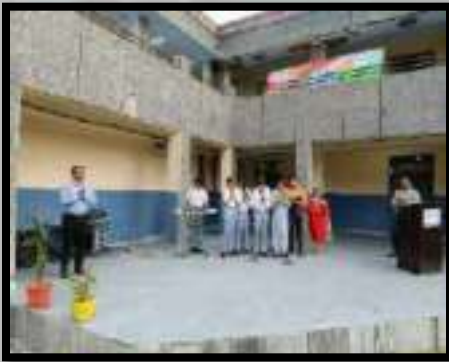
International Youth Day