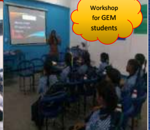
Workshop for GEM students