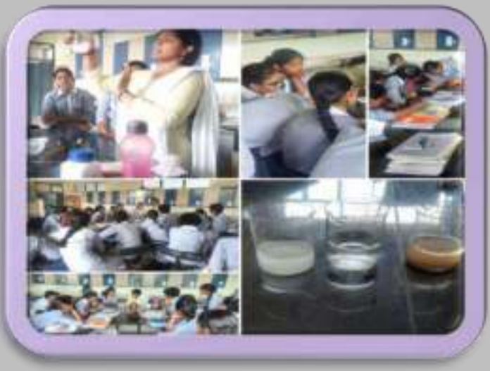
To differentiate between True solution, Suspension and Colloidal solutions.