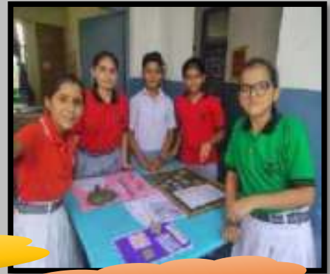
Exhibition of Replicas