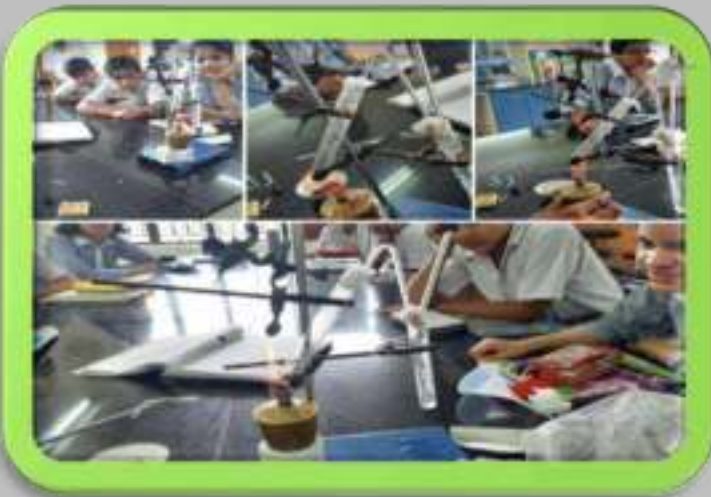
To confirm the evolution Carbon Dioxide