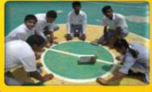
Finding Value of Pie in Ground