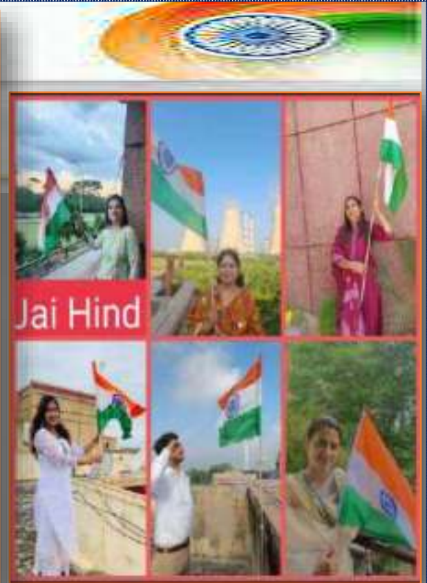
Selfie with Tiranga