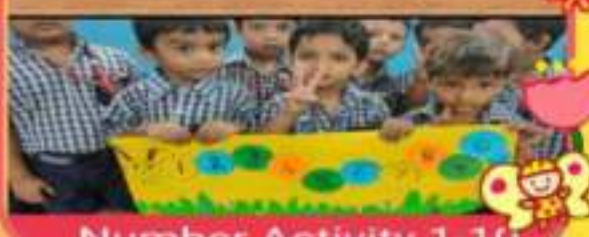
Number Activity 1-10