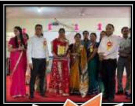
Solo Dance- (Sahodaya)