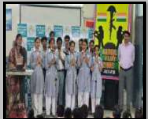
Kargil Vijay Divas