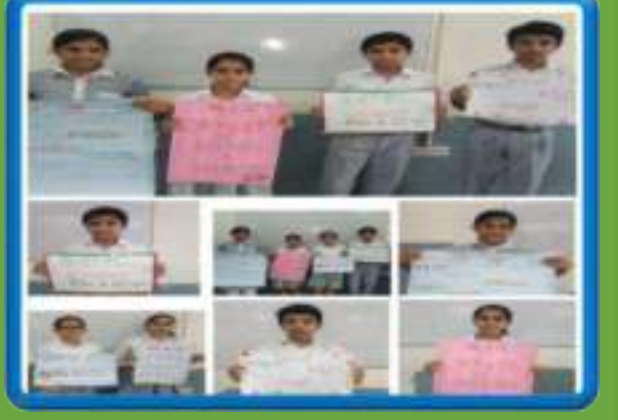
'नारा लेखन: शिक्षा'