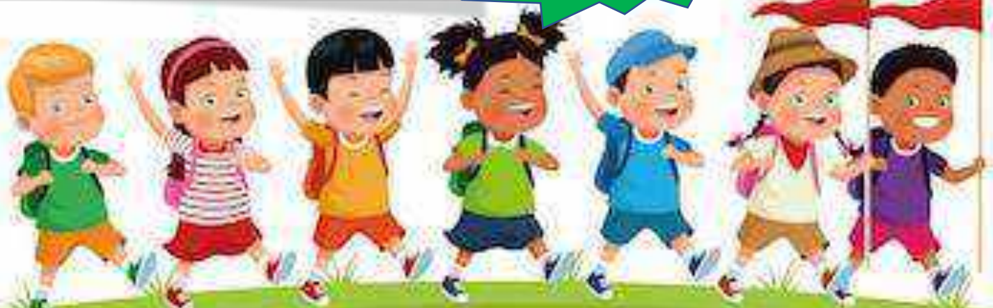
Gurukul Sanghralya, Jhajjar Trip

सातह्रषात्स | हमारे इतिहास और संस्कृति के बारे में जानने के लिए संग्रहालय और स्मारक हमारे जीवन में बहुत बड़ी भूमिका निभाते हैं। इसी उद्देश्य को ध्यान में रखते हुए बाल भारती पब्लिक स्कूल, झाड़ली ने "धरोहर क्लब" के अंतर्गत 17 सितंबर 2022 को "गुरुकुल संग्रहालय" और "झाजर के मकबरो" में कक्षा 6वीं से 9वीं के छात्र-छात्राओं के लिए "एक दिवसीय शैक्षिक यात्रा" का आयोजन किया। जहाँ बच्चों ने इतिहास से जुड़ी प्राचीनतम जानकारी प्राप्त की और सिंधु घाटी सभ्यता के खिलौने, वैदिक युग के देवी-देवताओं की मूर्तियां, प्राचीन और मध्यकालीन सिक्के जो वे किताबों में पढ़ते हैं।