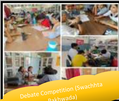
Debate Competition (Swachhta Pakhwada)