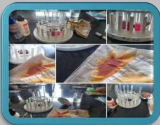
To see the colour changes on adding acid base indicators.