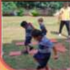
Puddle Jump Activity