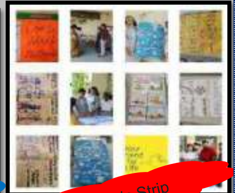
Exhibition: Comic Strip