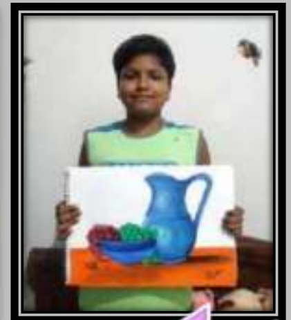
Still Life with Colours (BBPS-INDERPRASTHA YOJNA)