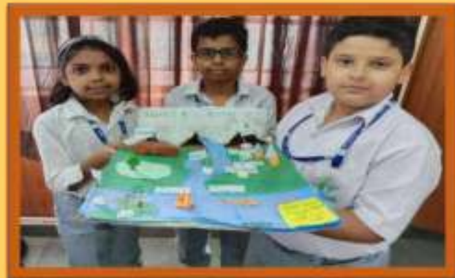
Stages of River