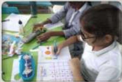
Solving Equations Balancing Method