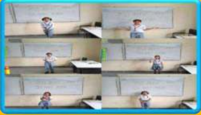
हिंदी दोहा गायन