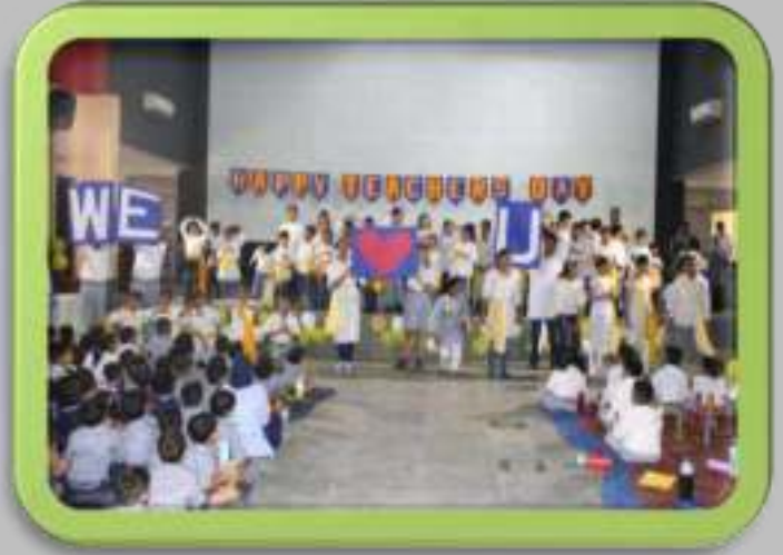
SHAKESPEARE HOUSE- ASSEMBLY