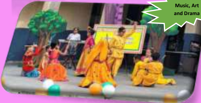
Music, Art and Drama