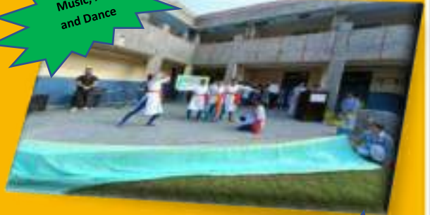
Music, Art and Dance