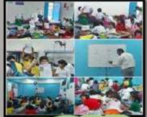
Warli Art Activity