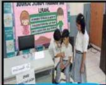
Programme on HFMD