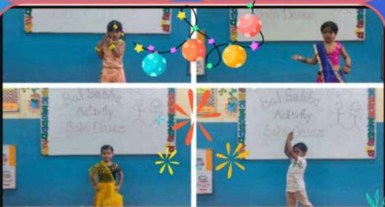
Solo Dance Competition