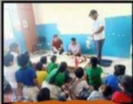
Cooking without fire