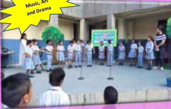
Music, Art and Drama