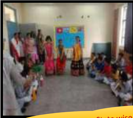
Fashion Show - State wise attired in Traditional Dresses