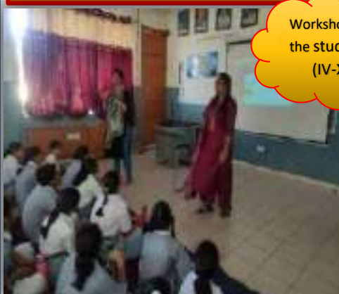
Workshop for the students (IV-X)