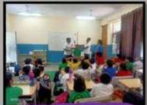
How to measure BMI