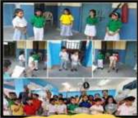
Run, Solve Burst