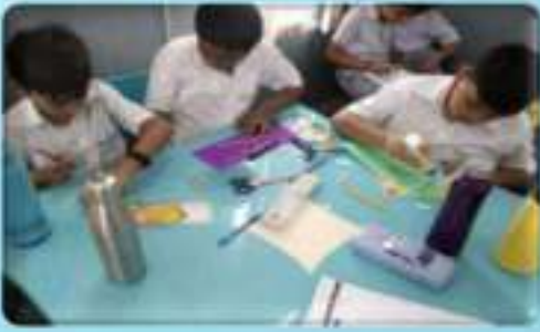
Make Polygons with Match Sticks