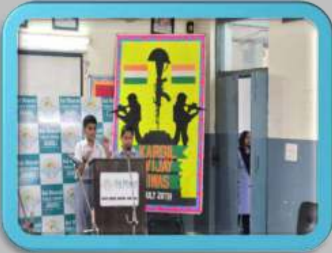
TAGORE HOUSE- ASSEMBLY