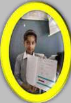
Find HCF Using Paper Cutting and Pasting