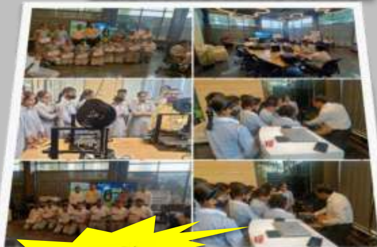
PIET Panipat Trip

Outbound learning experiences are an integral part of teaching learning process of our school. Bal Bharati Public School, Jharli has taken initiatives for giving real life experiences to its students. The school organised a one-day visit to Idea Lab at Panipat Institute of Engineering and Technology (OLE) for students of class 9 th and 10 th on 30 th July, 2022 to educate our students about the technological manifestation as a way of life. Sessions on the topics – Laser Printing, 3D – Printing, IOT (Internet Operated Things), AR-VR were organised. A group of 10 students were taken separately to different Labs for giving hands on experiences. The students participated actively and asked thoughtful questions. All these sessions helped in increasing the critical thinking in students. Certificates of appreciation were given to all the students and teachers who attended the session.