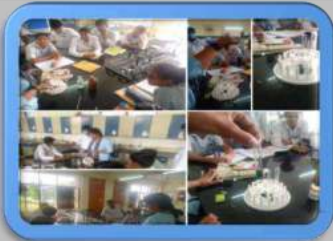
Activity to show the reactions of acids and bases with metals