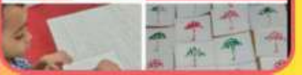
Colour Magic Activity