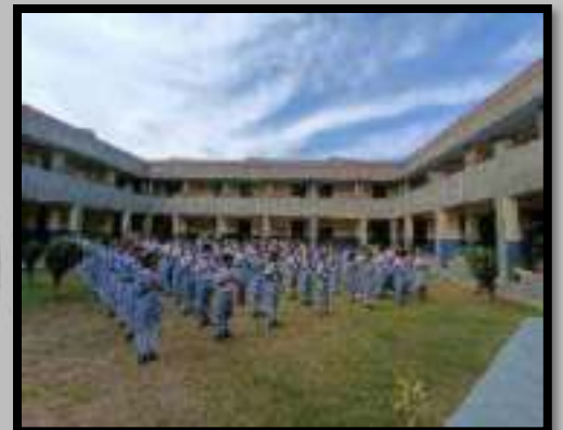
Screen Time-Game Addiction