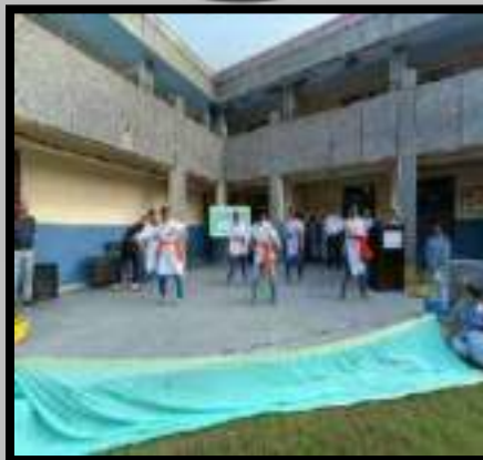
Ganesh Chaturthi Celebration