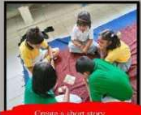
Create a short story