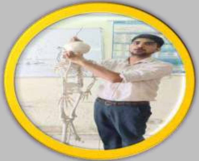
Human Skeletal System