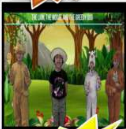
Fusion Fable (BBPS- ROHINI)