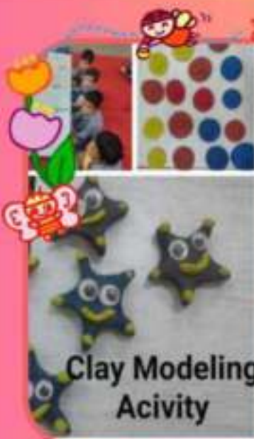
Clay Modeling Activity