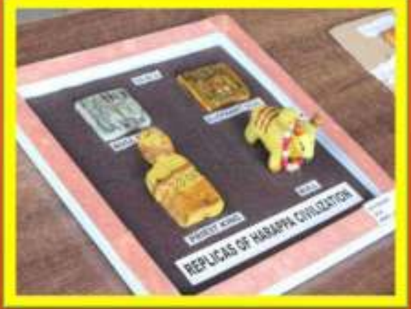
Indus Valley Civilization