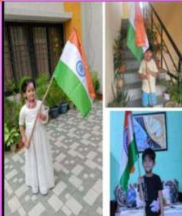
Har Ghar Tiranga Drive