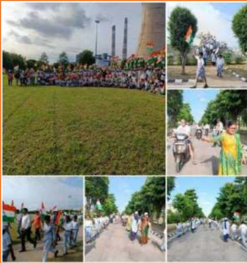
March past in nearby Colony