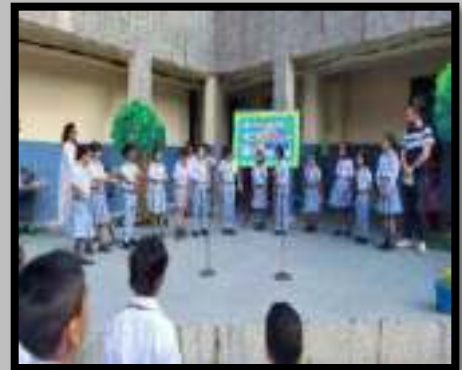
Hindi Divas Celebration