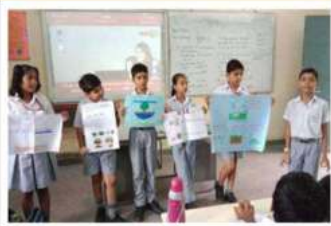
Awareness about soil Conservation.