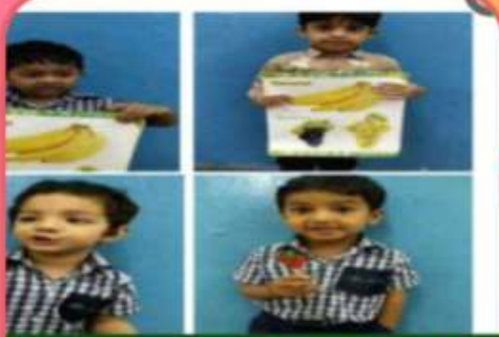
Show & Tell