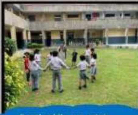
Speak while you catch