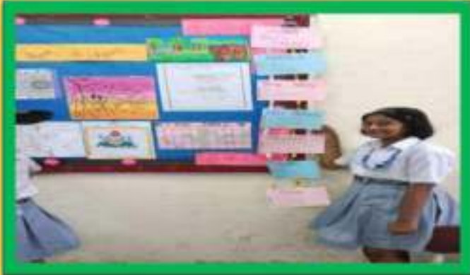
Wall Hanging showing diversity