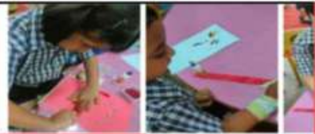
Rakhi Making Activity