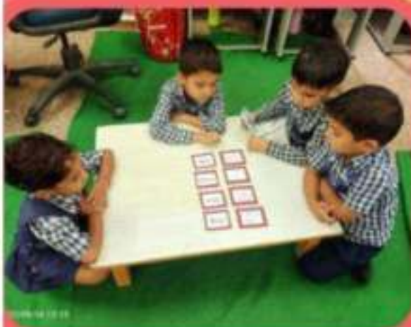
BLOCKS AND MATHS